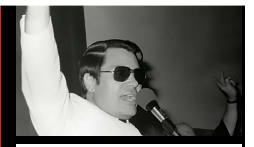
Cults are famous for their apocalyptic ideology and horrible ends. What are the key signs that a cult will end in violence?